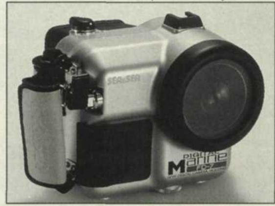
The Sea & Sea Digital Marine FD-7 housing was made for the Sony MVC-SD-7 digital still camera. The photos are stored on a 31/2 inch floppy disk in the camera, they can be viewed using the camera or a PC. The camera sells for $799; the housing is $1,625.