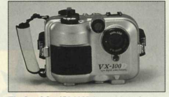
The Sea & Sea VX-100D housing was designed for the Sony DCR-SCI00 Digital Video Cassette Camcorder. The camera retails for $2,099, the housing for $1,999.

take digital to the depths of the sea (or at least to 200 feet) with its VX-1000 Pro housing. And since Sea & Sea is now a Sony dealer, you can buy both camera and housing at the same time. The Sony DCR-VX1000 camera retails for $4,199; the VX-1000 Pro housing is $3,995.