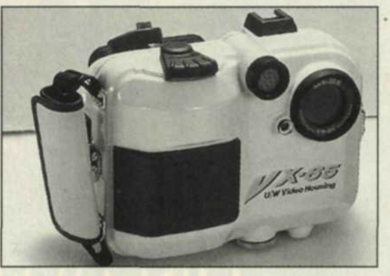
The Sea & Sea VX-65 housing takes the Sony CCD-SC55 or CCD-SC65 high 8 video camera underwater. The camera sells for $1,499; the housing is $1,299.

lows the connection of the optional external monitor that fits on the top of the housing. The VMC-50/V housing for Casio's VM-50 video monitor comes in handy for situations when you can't always have your eye focused on the internal viewer. An optional wide angle con-