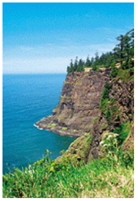
Digital cameras offer a world of convenience and flexibility. From topside snapshots to capturing underwater images, the digital revolution is changing how divers take pictures./font>

If 10 years ago someone told you that it would be possible to take pictures without film, you probably would have just laughed. Today, thanks to technological innovations, this wishful dream is a reality. You can now take pictures at the speed of light without the aid of film and see them on a screen just seconds later. Best yet, if a picture doesn't suit your fancy, you can make it disappear just as easily.