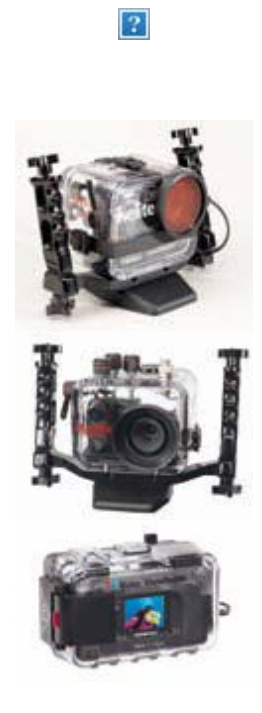
image storage since they are compact and lightweight. You can preview your images in the camera or on a video system and delete those that don't make the grade. The memory cards do incur more up-front cost, but can be used time and time again.

Agfa www.agfahome.com (201) 440-2500 Canon www.usa.canon.com (800) OK-CANON Epson www.epson.com (800) GO-EPSON Fuji www.fujifilm.com (800) 800-FUJI Hewlett Packard www.hp.com (888) HP4-FUNPICS Ikelite www.ikelite.com (317) 923-4523 Kodak www.kodak.com (800) 242-2424 Leica www.leica-camera-usa.com (800) 222-0118 Light & Motion www.lmionline.com (831) 645-1525 Minolta www.minoltausa.com (201) 825-4000 Nikon <u>www.nikonusa.com</u> (800) 645-6687 Olympus <u>www.olympus.com</u> (800) 221-3000